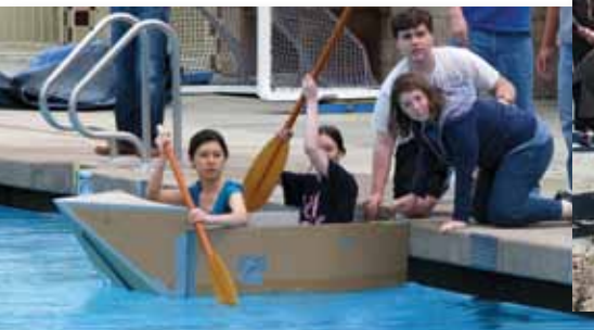
AP Physics Cardboard Boat Race Winning Team

Some recent Foundation initiatives and achievements include: Last year, 45% of Foundation funds paid for 31 additional class sections, effectively reducing class size in 152 core subject and foreign language classes. The Foundation made seven important electives possible, including AP Physics, AP Latin, Drama and Journalism. The Foundation’s professional development program recently won a prestigious Apple Award from the California Consortium of Education Foundations and a J. Russell Kent Award for innovative programs. Our students benefit immeasurably from our investment in teaching excellence. This year, the Foundation will be funding state-of-the-art equipment for M-A’s new media arts building. Our commitment of $1.6 million demonstrates a simple truth: our students deserve the support of an active community that will step-up and continue to participate in making their M-A experience great.