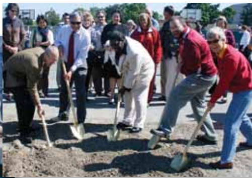
Groundbreaking Ceremony for M-A Media Arts Building