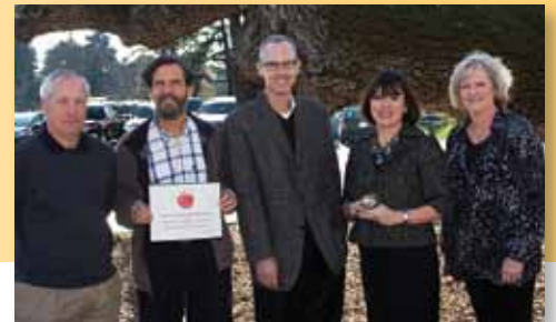
Professional Development Program Wins Apple Award

The Foundation has committed $1.6 M for 2011–12 school year—a 23% increase over 2010-11 fundraising.